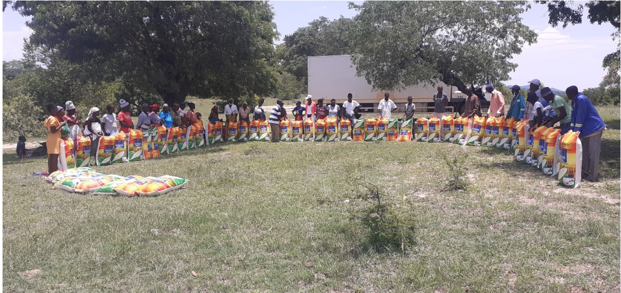
BELOW: Ruware brethren and their mealie meal